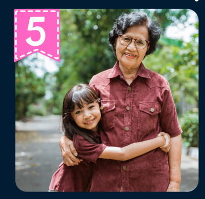
Prepare for and embrace growth.

Invest in and protect Adelaide's natural assets including parks, walking / cycling trails, beaches and open spaces to ensure they are high-quality and inviting to encourage greater use and recreation. This can be supported by an increase in the rate base of inner-city densification and could include improving the water quality of the River Torrens Lake (from the Weir to Frome Street), enhancing the Adelaide Park Lands to encourage more use and recreation, and implementing more cafés / kiosks, art, nature play, lighting and amenities along the Linear Trail, all the way from Athelstone to West Beach.