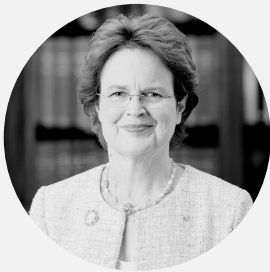
HER EXCELLENCY THE HONOURABLE FRANCES ADAMSON AC GOVERNOR OF SOUTH AUSTRALIA